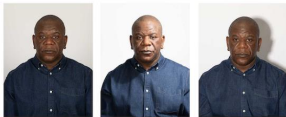
✓ Even lighting and no shadow