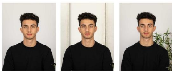
✓ Plain light-coloured background